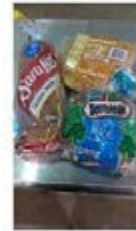
Actual Product May Differ

Category: Donated Product Storage: Frozen Second Harvest Type: e Retail-Wholesale (Don) Packaging: Order by the Pound On Hand: 450 Unit Weight: 1 Unit Measure: LB Qty Per Pallet: 1 Price Per: $0.00 Description: Pierre and Rapid City Agencies - Order how many pounds you would like. Make special requests in the comments during checkout. Sioux Falls Agencies - Packing - 20 lbs bread 15 lbs Pastry