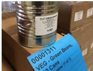
Green Beans Item #00001311 $4.14/case