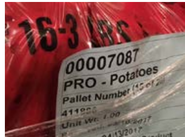
Potatoes The potatoes are $0.05/lb. Order by the pound